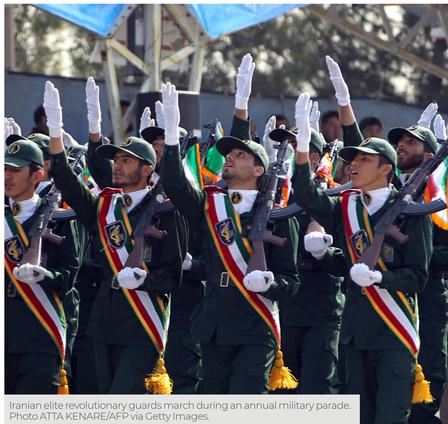
Iranian elite revolutionary guards march during an annual military parade.

Proscribing the group would make it a criminal offence to be associated in any way with the IRGC. It is almost certain that the proscription of the IRGC would further damage UK-Iranian relations. The group