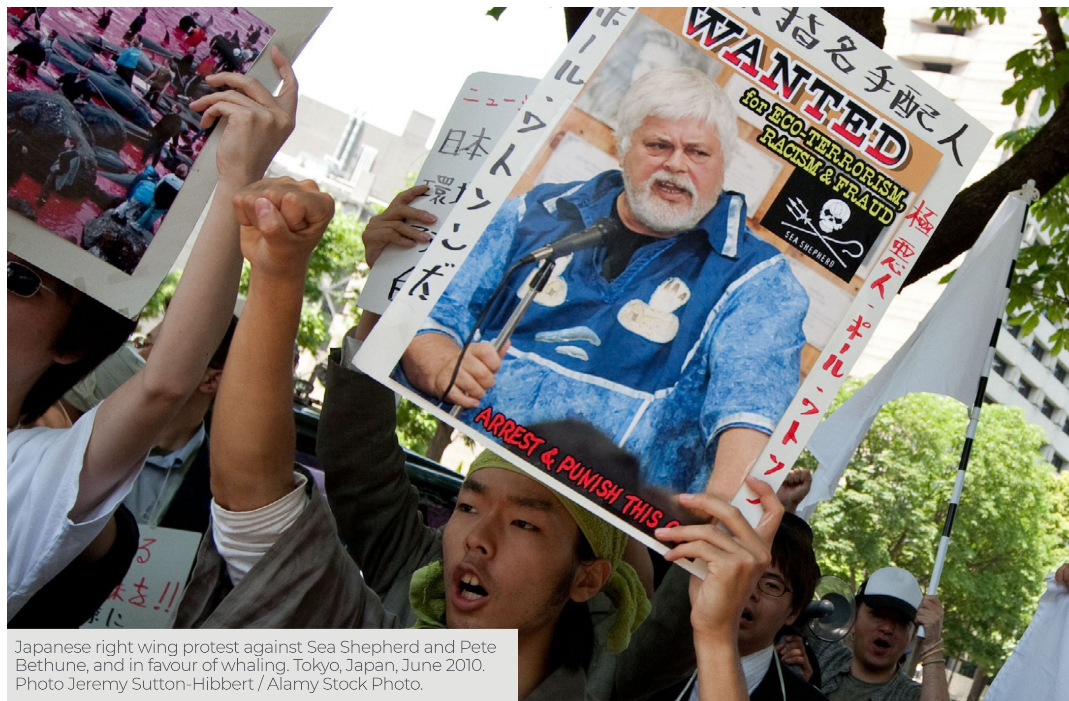
Japanese right wing protest against Sea Shepherd and Pete Bethune, and in favour of whaling. Tokyo, Japan, June 2010.

The threat posed by environmentally-motivated