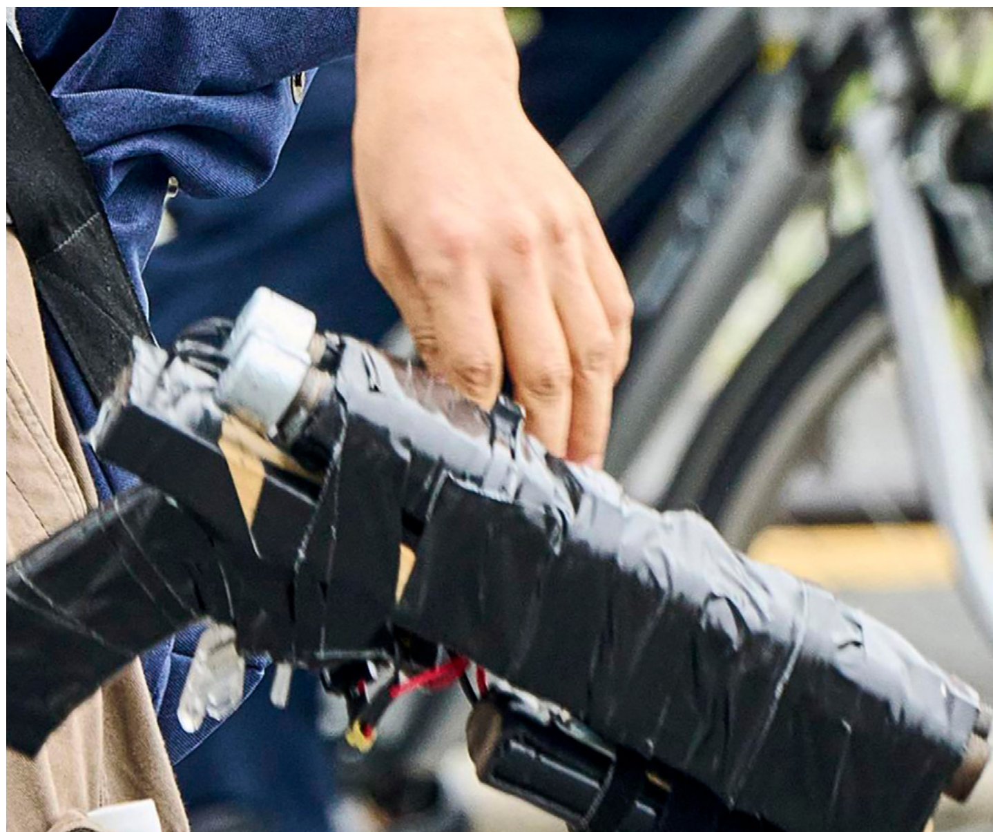
Shinzo Abe, the former prime minister of Japan, was assassinated on Friday by an assailant with an improvised firearm.

The assassination of the former Japanese Prime Minister illustrates how firearms can be constructed and used to carry out attacks, even in countries, like the UK, where gun control legislation makes it very difficult to acquire firearms. Experts estimate that