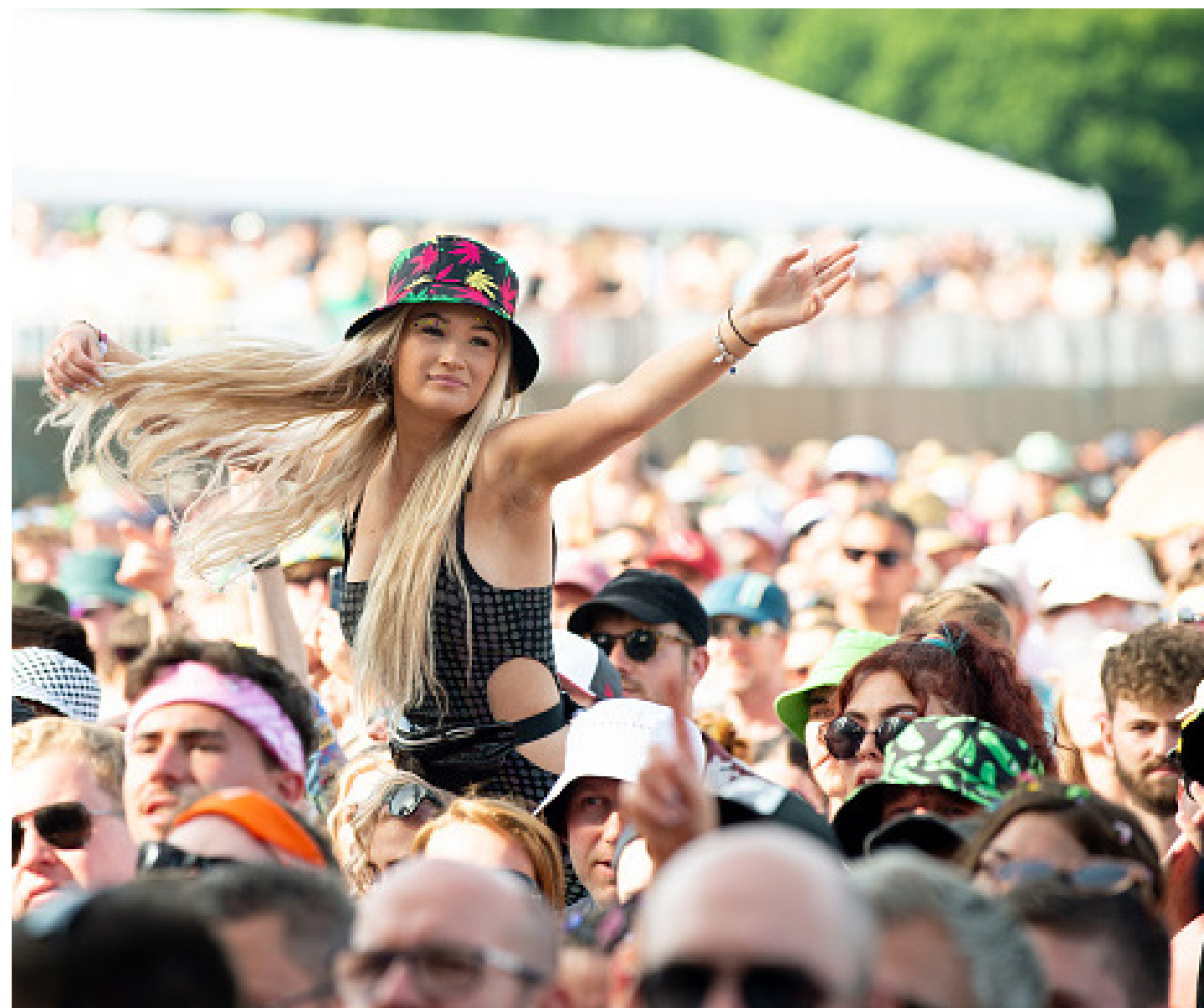
JUNE 17: Festival goes at The Isle of Wight Festival 2022 at Seaclose Park on June 17, 2022 in Newport, Isle of Wight.

The foiled plot comes amidst an upward trend in youth arrests in the UK. Senior counter terrorism officers recently revealed that more under 18s were arrested for terrorist-related activity between March 2021 and 2022