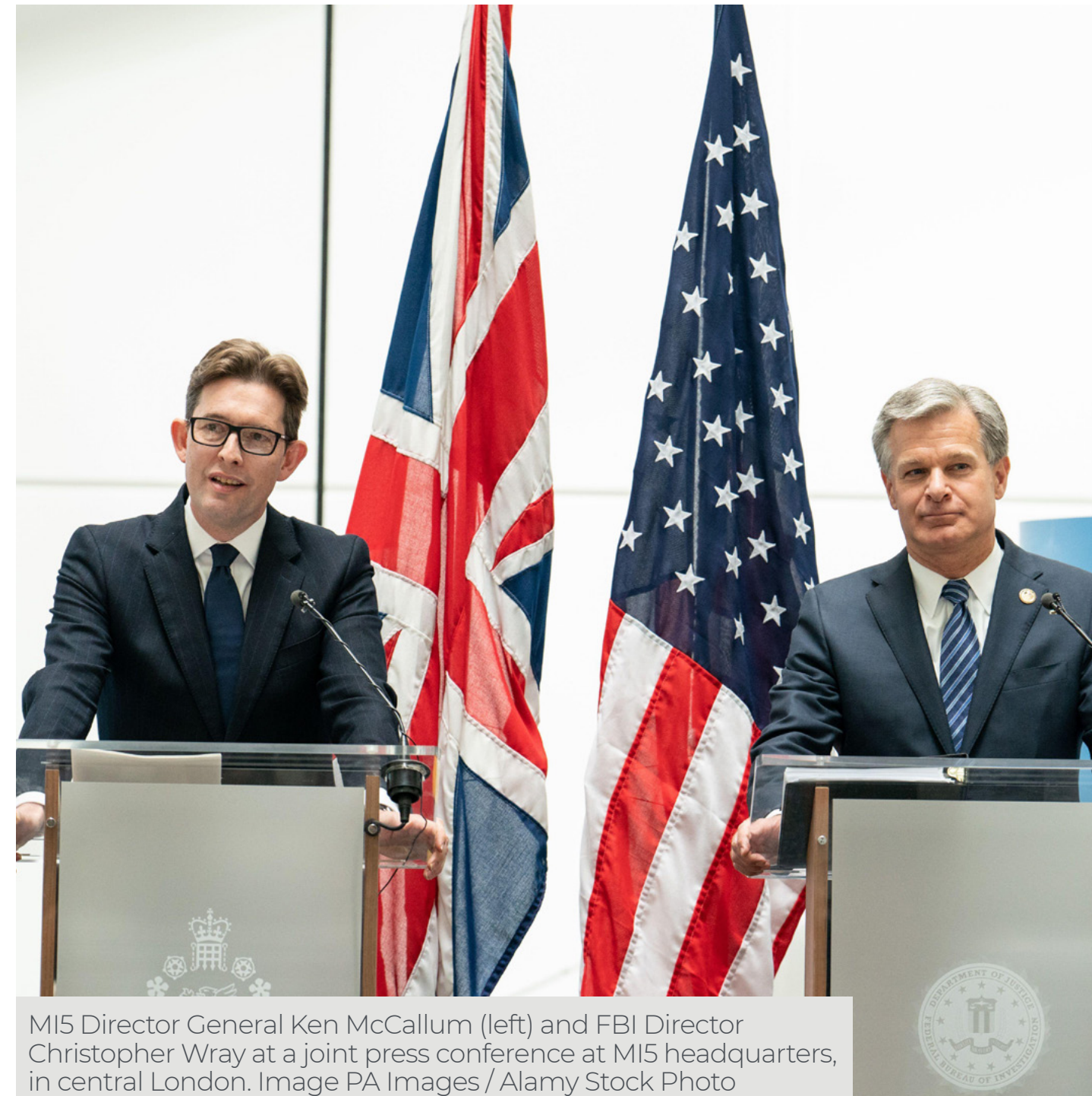
MI5 Director General Ken McCallum (left) and FBI Director Christopher Wray at a joint press conference at MI5 headquarters, in central London.

Social media platforms will continue to play a significant role in the growth of far right extremism, which has recently been recognised by the