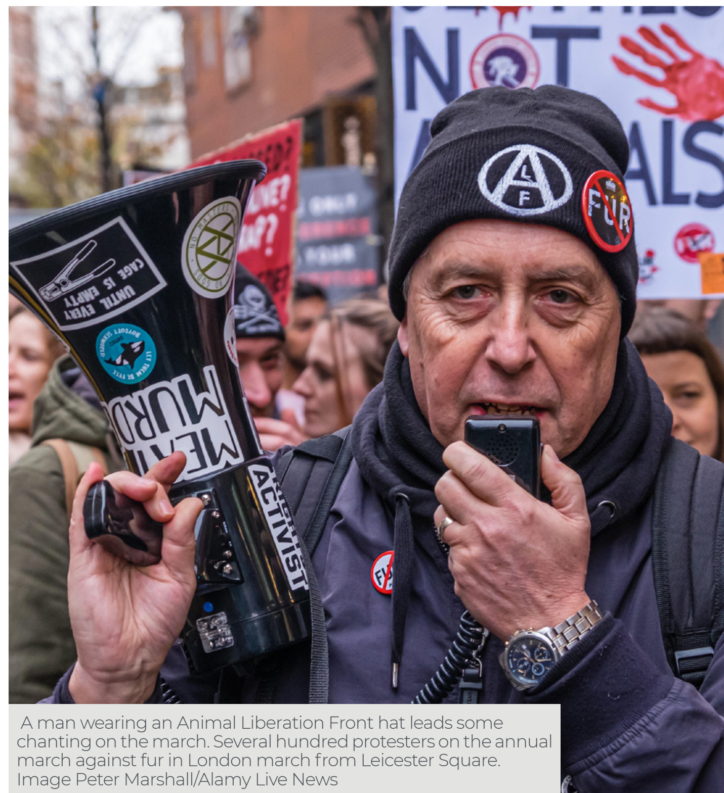
A man wearing an Animal Liberation Front hat leads some chanting on the march. Several hundred protesters on the annual march against fur in London march from Leicester Square.

The vast majority of eco-terrorism attacks involve the use of incendiary or explosive devices, and property damage – rather