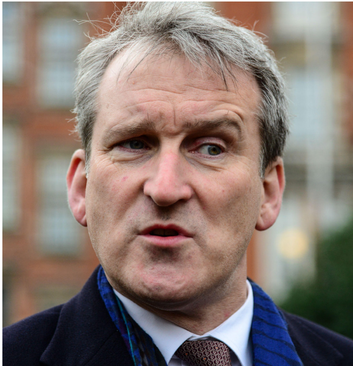
Damien Hinds, Minister of State for Security and Borders.

In an interview echoing recent statements from both MI5 and Counter Terrorism Policing, Damien Hinds, Minister of State for Security and Borders, has expressed concerns about the evolution of terrorists in the UK, particularly following the COVID-19 pandemic. He believes terrorism trends in the UK have shifted. Where previously, the threat was associated with plots directed and carried out by global terrorist organisations, the trend has shifted toward “self-directed” attacks. This trend shift has happened over a number of years; however, Hinds believes this has been exacerbated by the extended lockdowns enforced in the UK as a