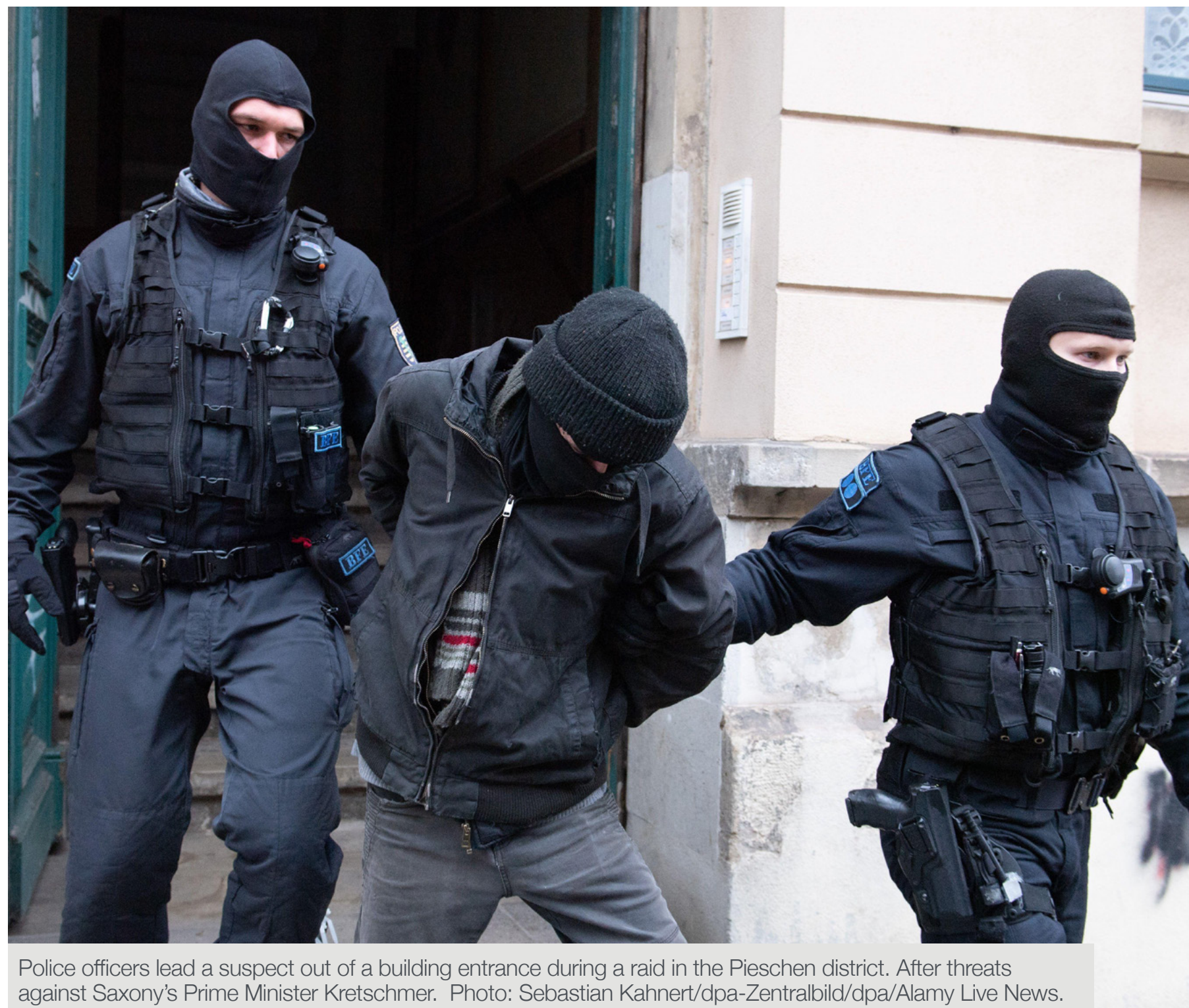
Police officers lead a suspect out of a building entrance during a raid in the Pieschen district. After threats against Saxony's Prime Minister Kretschmer.

The use of crossbows or bows and arrows is not commonly seen in the UK, however they have proven to be deadly weapons in previous murder cases. Between 2018-2020, there were three incidents involving crossbows which resulted in the murder of four individuals and the injury of another. These incidents were all targeted, involving direct action against the individual victims as opposed to indiscriminate attacks. While these particular incidents were not terrorism related, in January 2020, a man was charged under the Terrorism