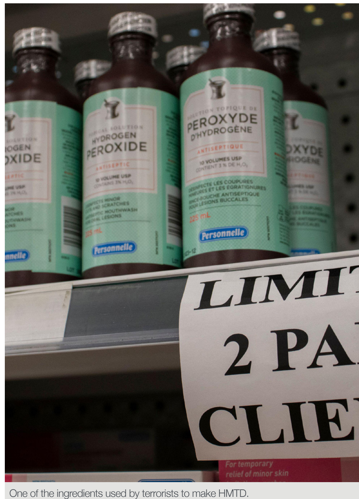
One of the ingredients used by terrorists to make HMTD.