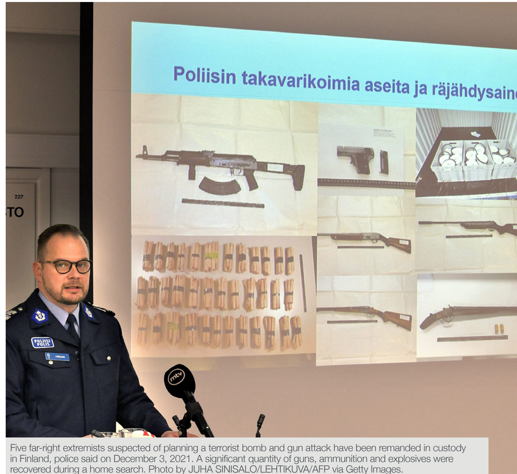
Five far-right extremists suspected of planning a terrorist bomb and gun attack have been remanded in custody in Finland, police said on December 3, 2021. A significant quantity of guns, ammunition and explosives were recovered during a home search.

The five men arrested are not suspected of being members of an extremist organisation. Instead, they are described as a small, independent group. Typically, incidents of this nature have involved small independent groups or lone actors, rather than large organisations, a characteristic of the type of right-wing extremism seen in Europe. This is likely to increase, particularly as incidents of right-wing