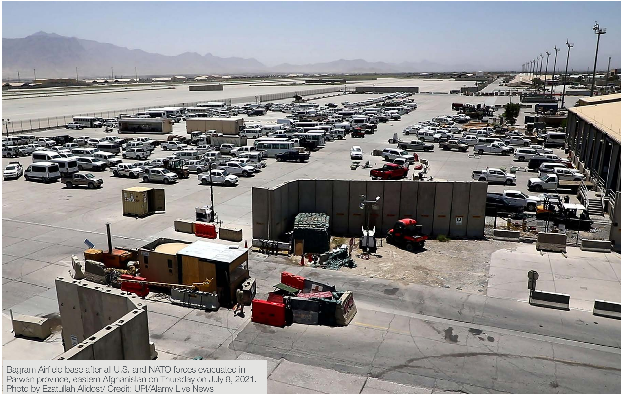
Bagram Airfield base after all U.S. and NATO forces evacuated in Parwan province, eastern Afghanistan on Thursday on July 8, 2021.

The decision for American troops to withdraw from Afghanistan has received bipartisan criticism in the US as the decision could destabilise Afghanistan, the wider region and