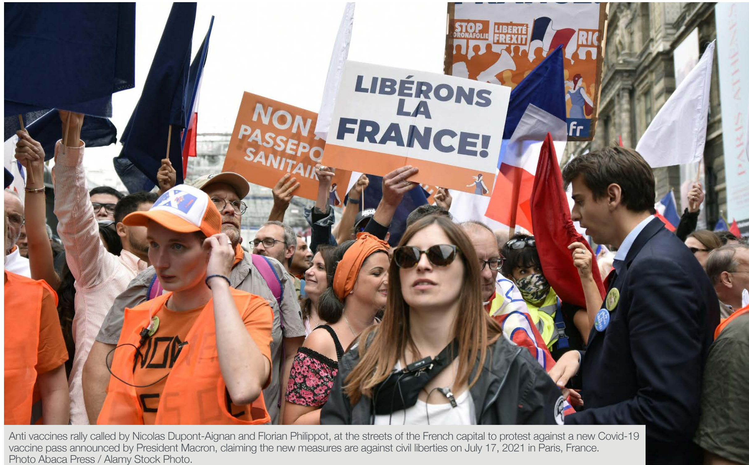
Anti vaccines rally called by Nicolas Dupont-Aignan and Florian Philippot, at the streets of the French capital to protest against a new Covid-19 vaccine pass announced by President Macron, claiming the new measures are against civil liberties on July 17, 2021 in Paris, France.

Such attacks have possibly been exacerbated by politicians such as Martine Wonner calling for anti-vaccine protesters to 'lay siege' to the offices of politicians who backed the government's coronavirus policies. Whilst arguably not terrorist in nature, further such attacks against vaccine centres are a realistic possibility. Conspiracy