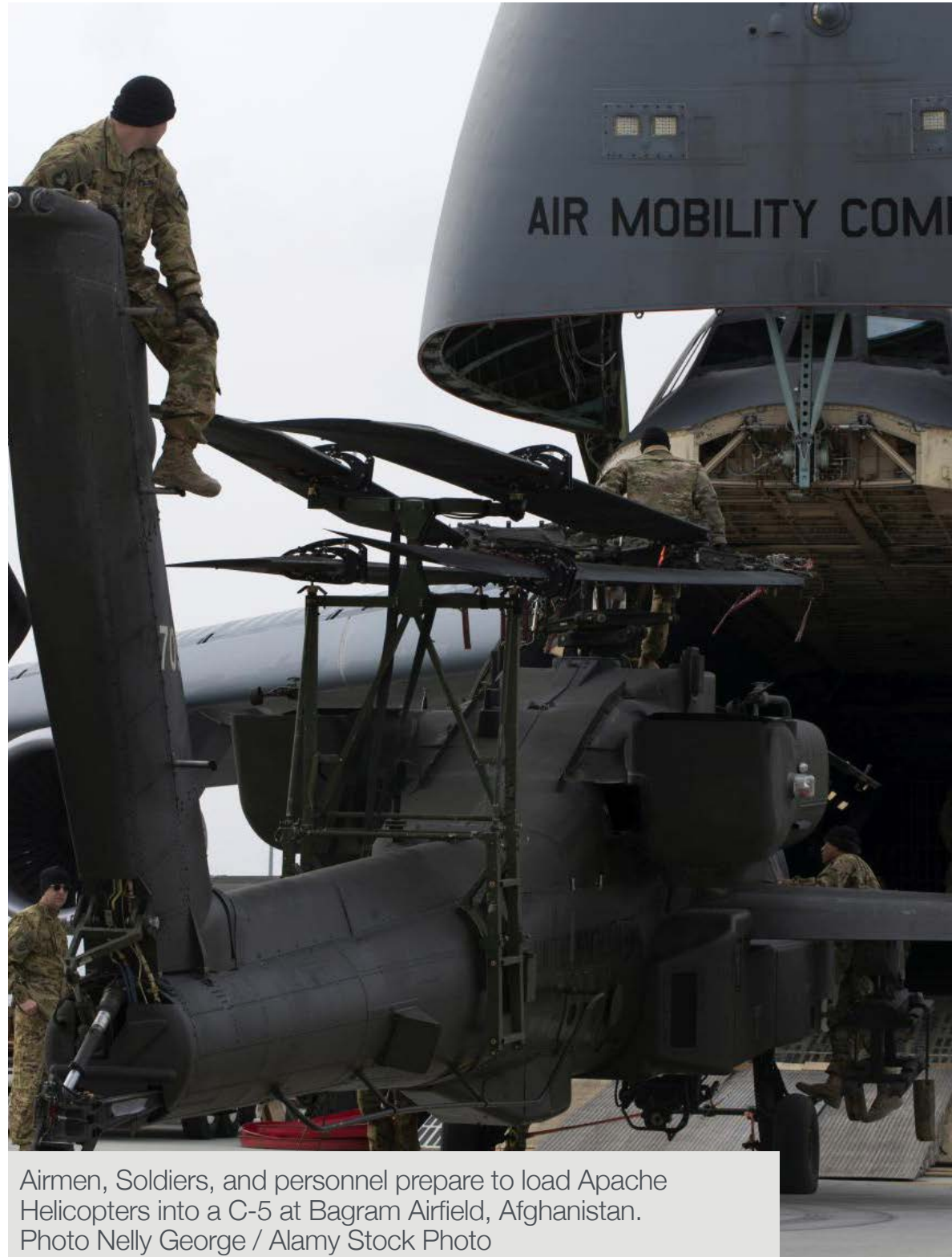
Airmen, Soldiers, and personnel prepare to load Apache Helicopters into a C-5 at Bagram Airfield, Afghanistan.

A key concern amongst analysts and policymakers is that, should the Taliban take control of the county, it will tacitly allow AQ to operate freely within its borders. US General Mark Milley, Chairman of the Joint Chiefs of Staff recently commented that the Taliban had 'strategic momentum' in Afghanistan. The group may then begin to plan and prepare attacks against the US, UK or other Western nations largely unchecked. It has largely been suppressed in Afghanistan through intensive counter-terrorism operations by the US military and Coalition forces. AQ has shown intent to continue conflicts with the