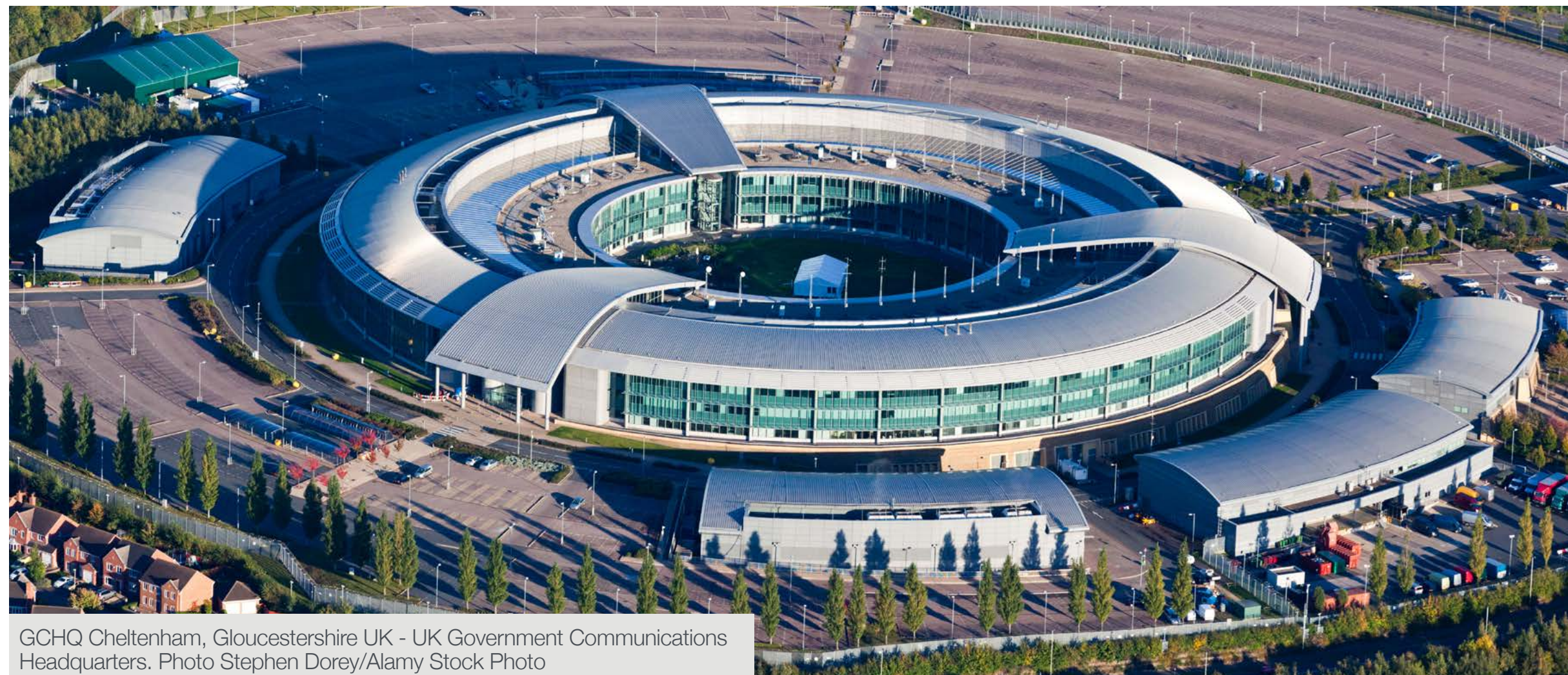
GCHQ Cheltenham, Gloucestershire UK - UK Government Communications Headquarters.

Islamist extremist terrorism, there is concern that less resourcing will be directed toward counter-terrorism efforts. This may also be exacerbated by financial constraints precipitated by the coronavirus pandemic.